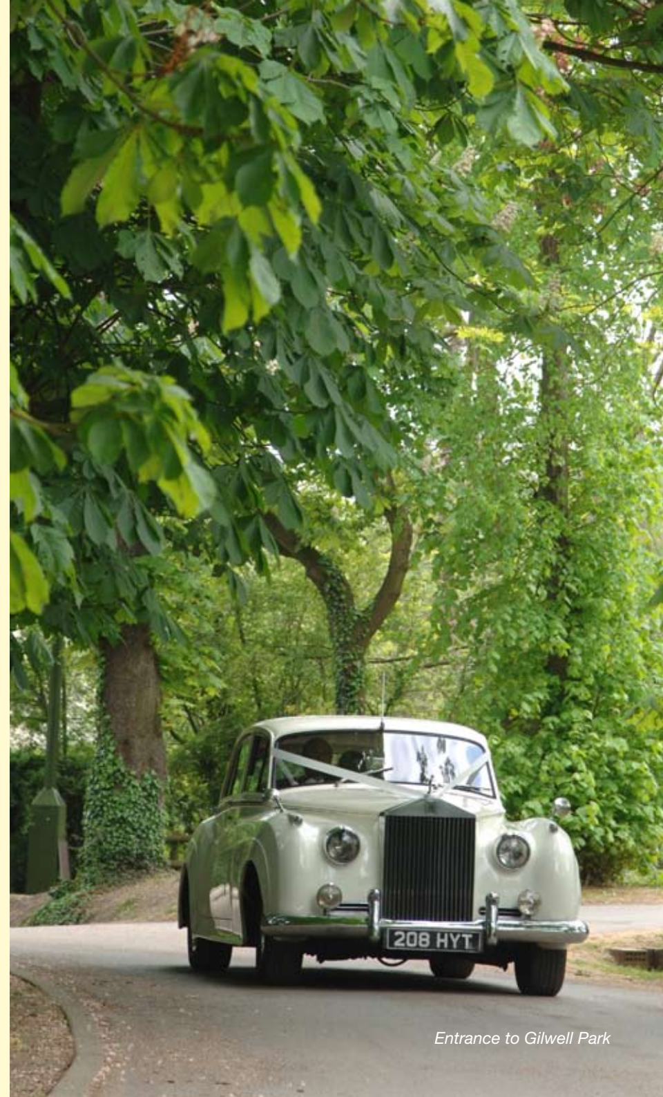
Entrance to Gilwell Park

"Just wanted to say a massive 'thanks'. We had such a fantastic day, everything we wanted to happen did and largely thanks to you guys. The organisation on the day was spot on"