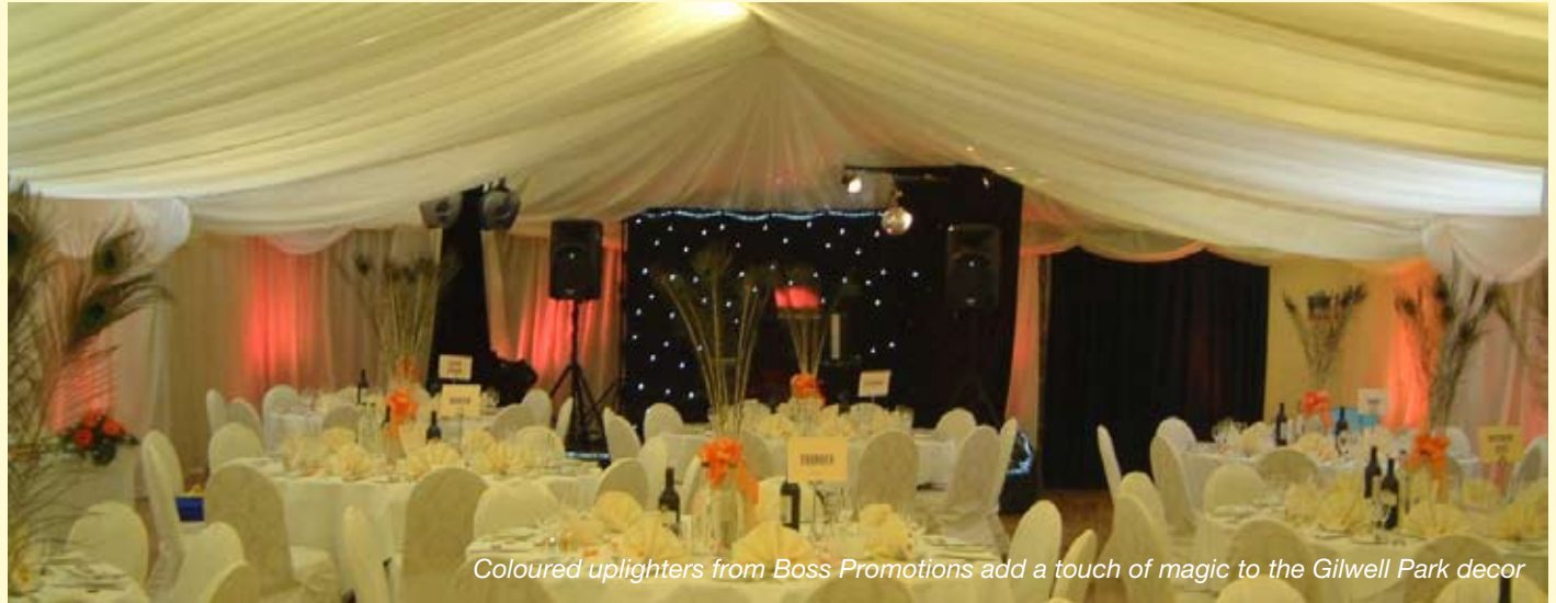
Coloured uplighters from Boss Promotions add a touch of magic to the Gilwell Park decor

To achieve this we meet with the bride and groom, discussing and noting their likes (and, of course, their dislikes), and agree a list of their songs, particularly for the early part of the evening that are special for them and their family and friends. Any tracks requested by them but not already in our collection are sourced specially for the event.