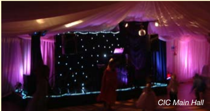
CIC Main Hall

We discuss music to be played during dinner whether it be a 'Rat Pack' selection, jazz, blues/soul, easy listening, songs from the shows, film themes, 50s classics, light baroque classical music, operatic arias, or whatever. With over 20,000 tracks to choose from, finding the right music is always easy for us. Requests for specific songs to be played during the evening can normally be met instantly because of the elaborate cataloguing system employed to keep track of the music.