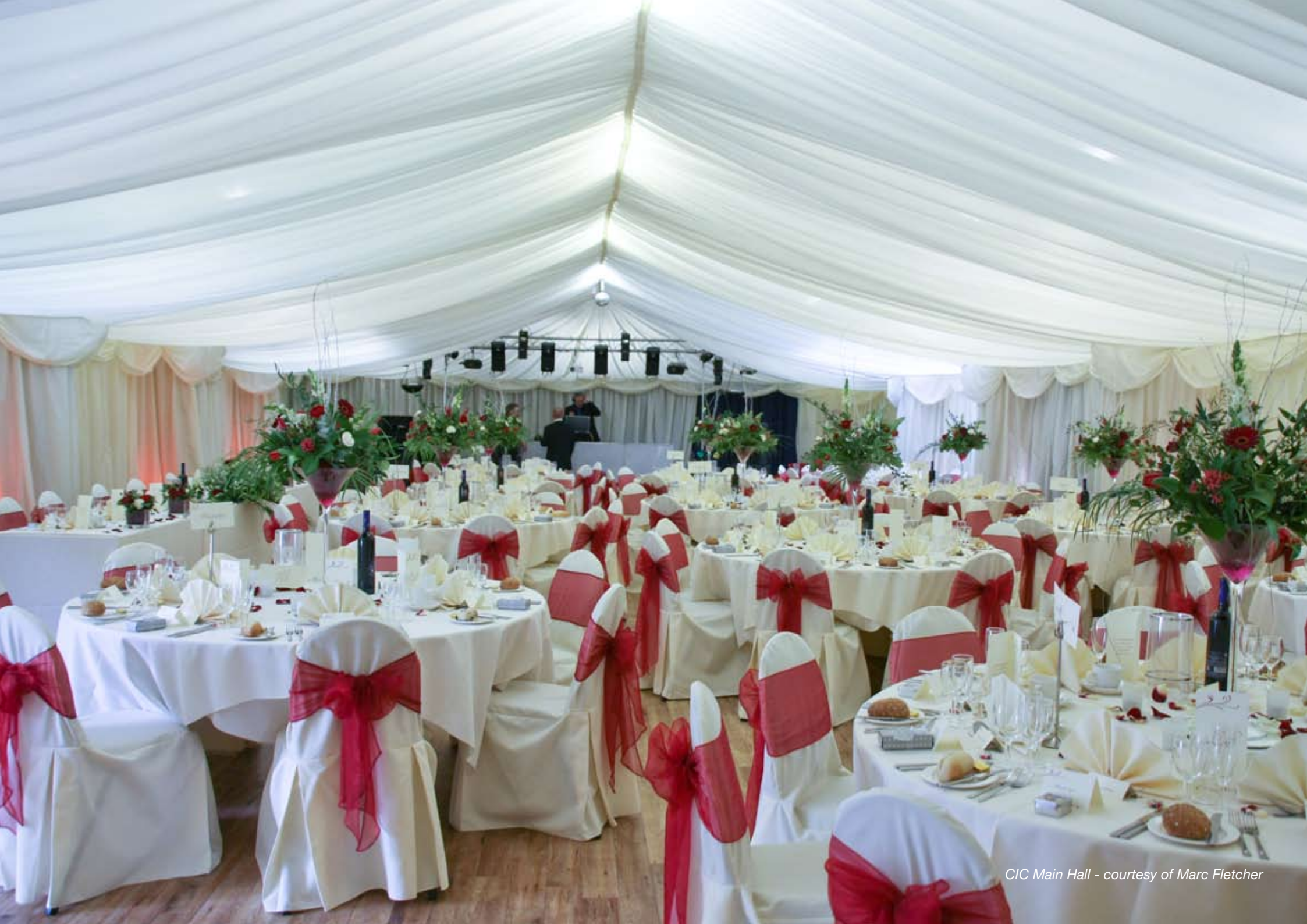
CIC Main Hall