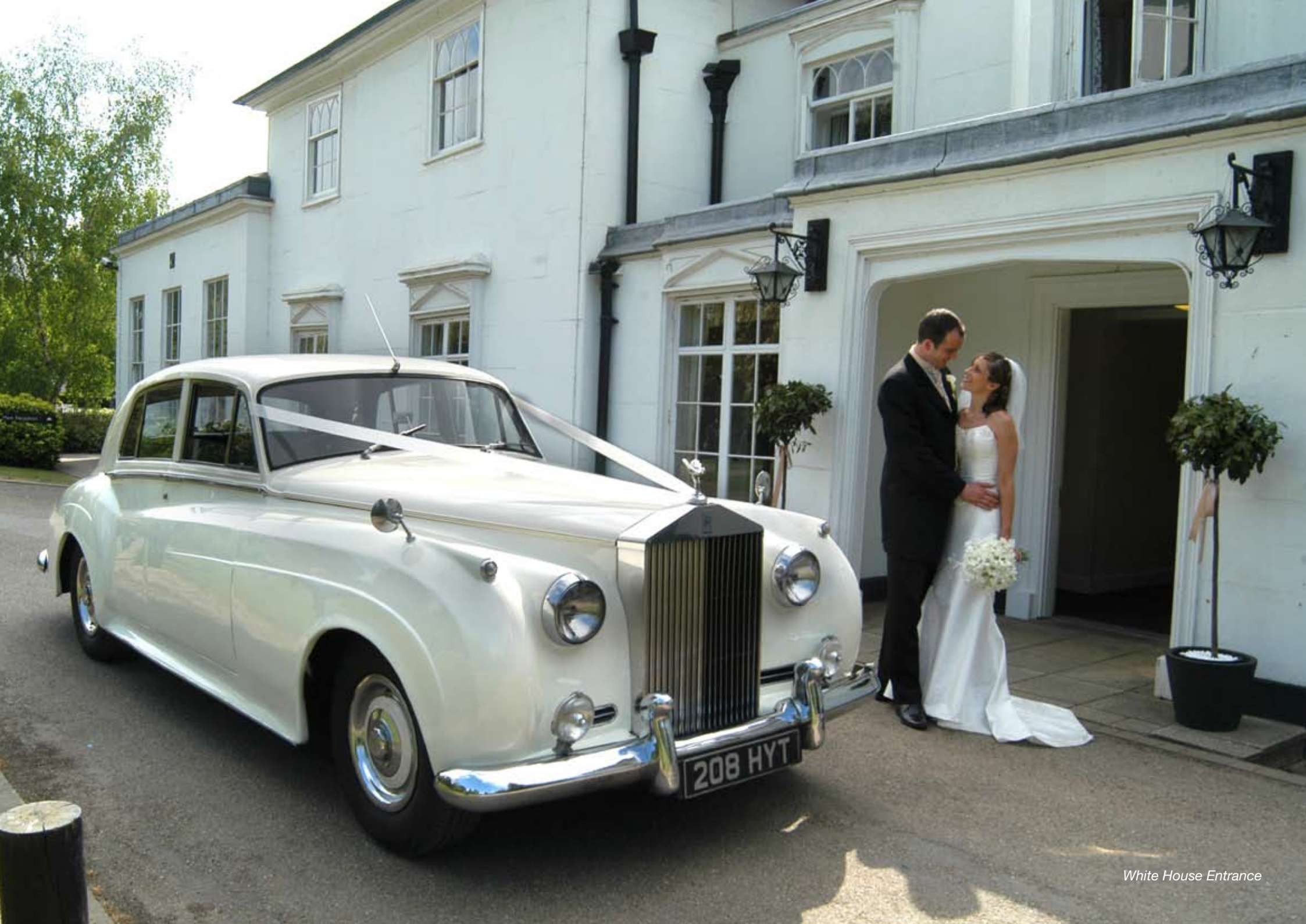
White House Entrance